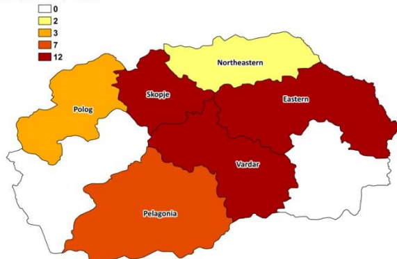
Visceral Leishmaniasis Incidence/10.000 (2008)